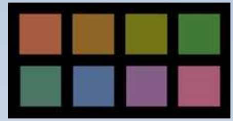
Approximation of CIE CRI Test Colors

Over the years, fluorescent phosphors have been tuned and refined to render those eight color samples well, i.e., very much like the incandescent or daylight references. But look at the “spikes” in the spectral power distribution (SPD) for the fluorescent source in Figure 1 below. If the phosphors were changed just slightly, shifting the emission wavelengths, the CRI score may drop significantly, but with little change in color rendering as perceived by the human eye. Phosphor-converted (PC) LEDs use broadband phosphors to score relatively high (70- 90+) on the CRI scale.