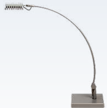
Example of directional task lamp using LEDs.