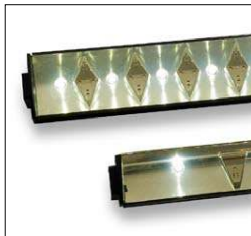
Close up of refrigerated case lighting.

Fluorescent lamps, especially those containing amalgam, do not provide full brightness immediately upon being turned on. Fluorescents using amalgam can take three minutes or more to reach their full light output. HID lamps have longer warm up times, from several minutes for metal halide to 10 minutes or more for sodium lamps. HID lamps also have a “re-strike” time delay; if turned off they must be allowed to cool down before turning on again, usually for 10-20 minutes. Newer pulse-start HID ballasts provide faster restrike times of 2-8 minutes. LEDs, in contrast, come on at full brightness almost instantly, with no re-strike delay. This characteristic of LEDs is notable in vehicle brake lights, where they come on 170 to 200 milliseconds faster than standard incandescent lamps, providing an estimated 19 feet of additional stopping distance at highway speeds (65 mph). In general illumination applications, instant on can be desirable for safety and convenience.