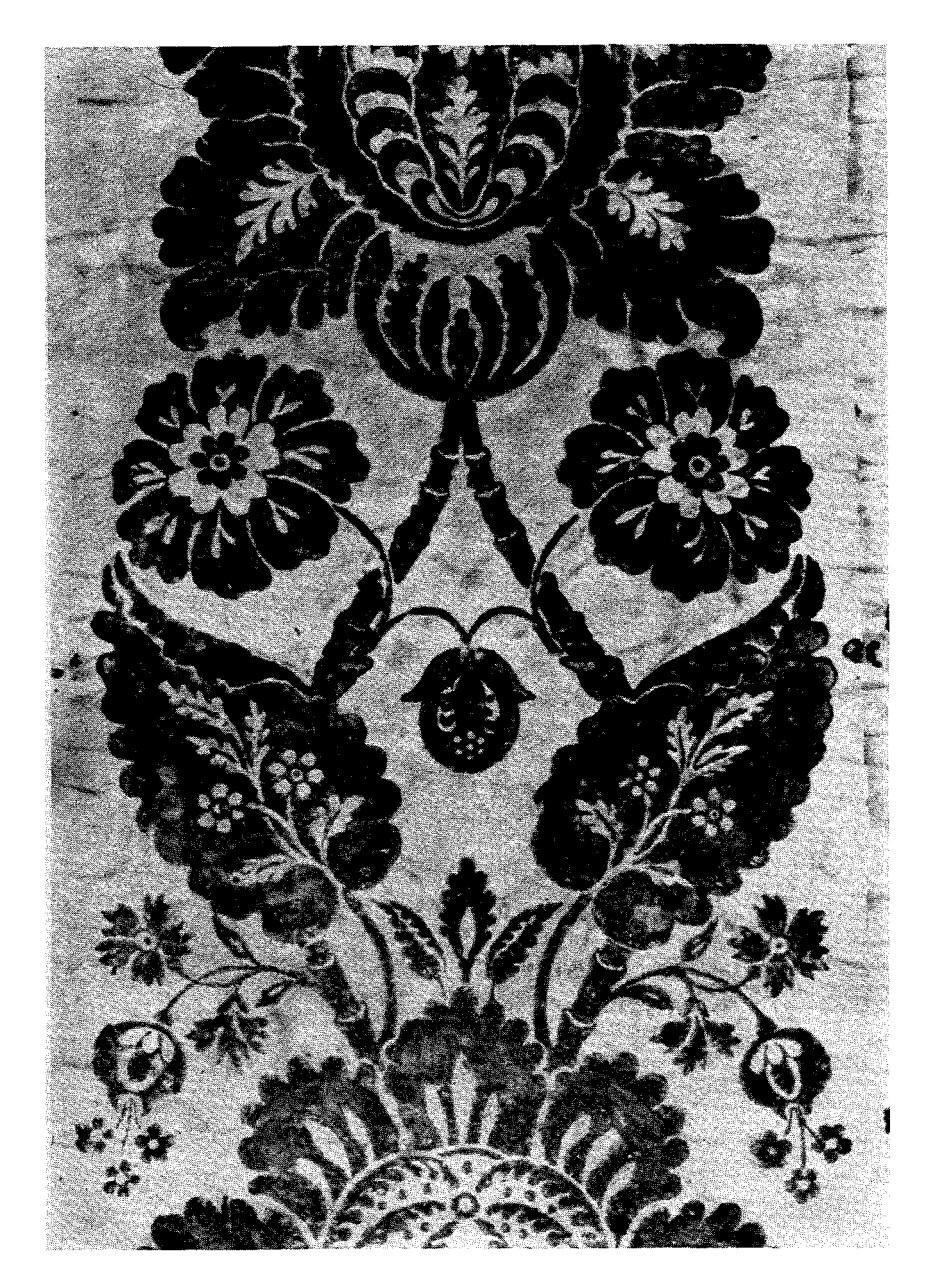
Figure 1: Pattern of the Wallpaper in the parlor. The bedroom wallpaper is of the same pattern.