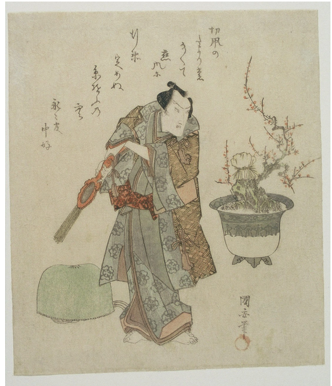
Fig. 10. Kuniyasu (ca. 1810–20), Man and Bonsai (8.2000.804.92), under infrared light.

a translucent, sometimes watery-looking blue. In ultraviolet it is a warm, light to medium gray. Examined with the infrared video camera it appears as a light gray tone or almost the same as paper tone (figs. 9–10). Although not evident in this undamaged print, dayflower sometimes has a drippy, mottled appearance where humidity or contact with moisture has caused the color to move or dissipate. This form of damage generally is not seen in indigo or Prussian blue.