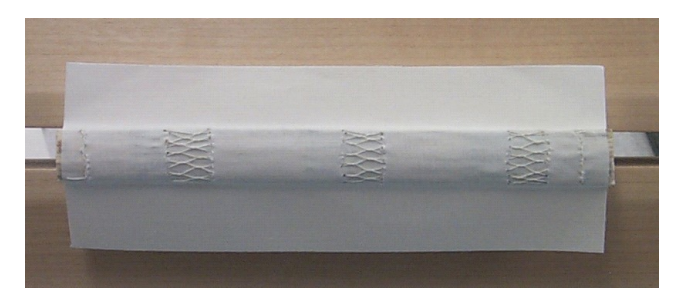
Fig. 4. Cotton cambric is glued on and the text block is sewn over the cambric.

continuum of options for retaining original sewing structures within a collections conservation framework.