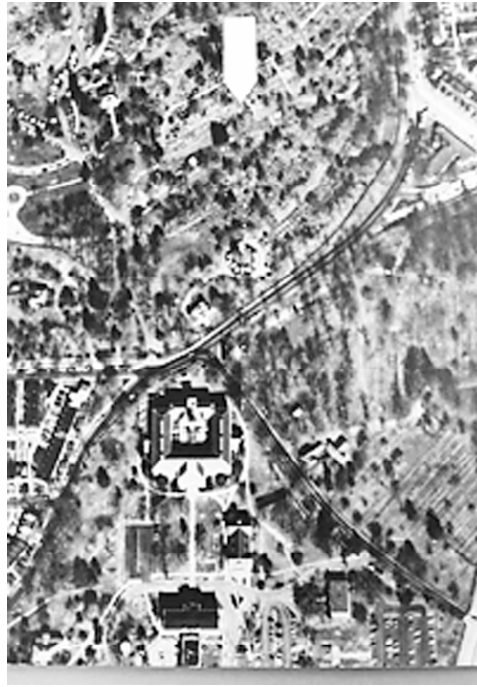
Fig. 4. Properly aligned mend just visible below the arrow

hardly visible. Again, no inpainting was done. Using this technique, the mended prints did not suffer from any local distortions as the two sides of the tear were reunited. The tears mended in this fashion were quite strong and did not fail when the photographs were flexed or held flat.