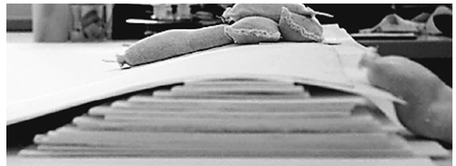
Fig. 2. Convex support board

This paper was presented as a poster at AIC 32nd Annual Meeting, June 9–14, 2004, Portland, Oregon. Received for publication Fall 2004. Color images for this paper are available online at http://aic.stanford.edu/bpg/annual/ .