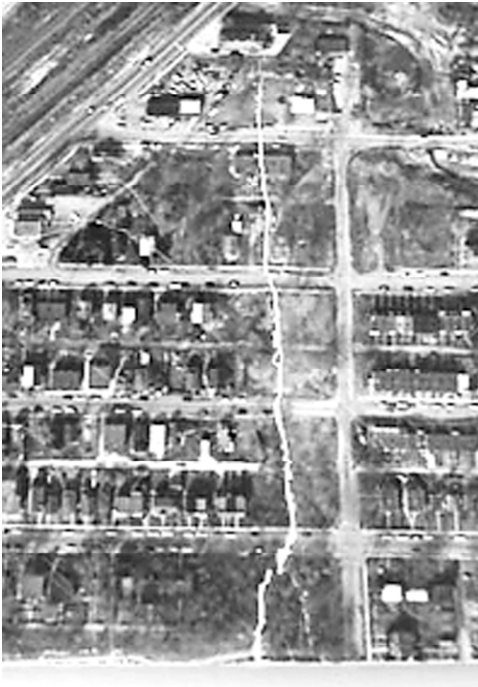
Fig. 3. Improperly aligned mend