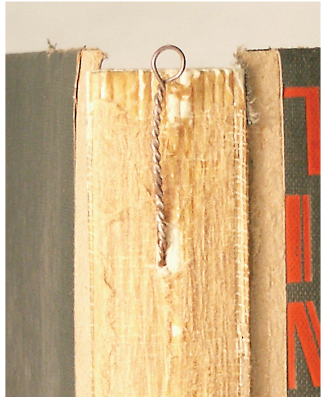
Fig. 3. Ten Years in Soviet Moscow . Exterior side view of the wire loop.