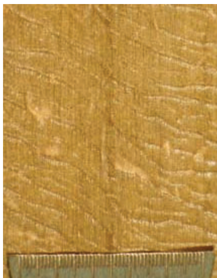
Fig. 6. Corypha taliera leaf epidermis. Herbarium, Fairchild Tropical Botanic Garden.

close to the hastula. Average leaf thickness was 0.016 in. The morphology of the leaf (fig. 6) is similar to Corypha umbraculifera .