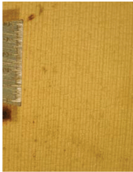
Fig. 3. Borassus flabellifer leaf epidermis. Note the orderly venation pattern. Microscale is 5 mm, with each division equal to 0.1 mm. Herbarium, Fairchild Tropical Botanic Garden.