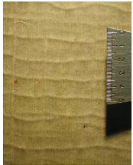
Fig. 4. Corypha utan leaf epidermis in raking light. Herbarium, Fairchild Tropical Botanic Garden.