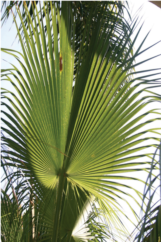
Fig. 1. Fan palm leaf showing leaflets and hastula.

illumination. The significance of venation in leaf identification cannot be overstated.