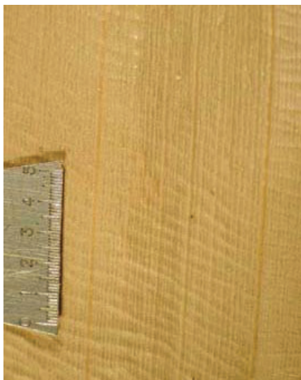
Fig. 5. Corypha umbraculifera leaf epidermis. Longitudinal bundle fibers are prominent, as are a greater number of transverse veins. Herbarium, Fairchild Tropical Botanic Garden.

Corypha taliera (Fairchild specimen #64420) is also a giant palm, and is currently found only in cultivation; its range is limited to west Bengal, India, Bangladesh, and western Myanmar. The leaves of this palm measure greater than 66 in. in length. Leaflets were up to 2-1/2 in. wide. Leaf thickness varied from 0.013 in. at leaf tip to 0.020 in.