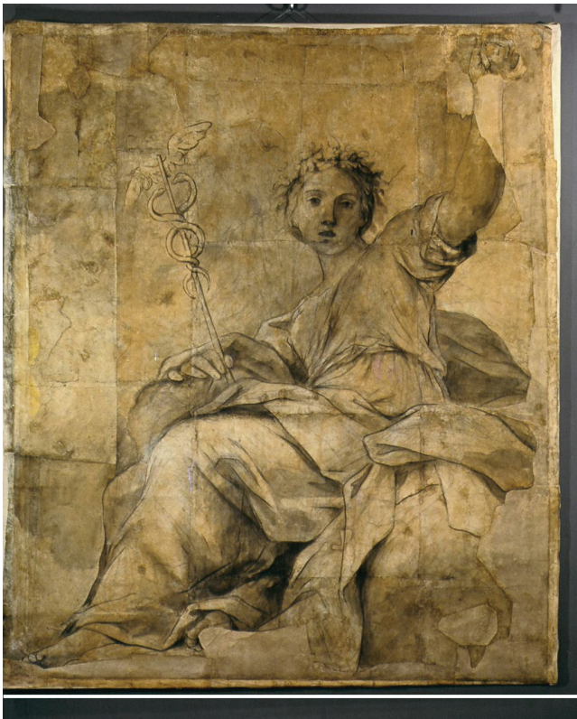
Fig. 7. Seventeenth-century Italian preparatory cartoon in charcoal on multiple sheets of overlapping paper before treatment

sure to practices that have filtered into our treatment vocabulary. This exchange has enhanced the North American and European traditions of inquiry, analysis, and practice that are the foundation of our training as paper conservators, and the Book and Paper Group has done much to promote these advances.