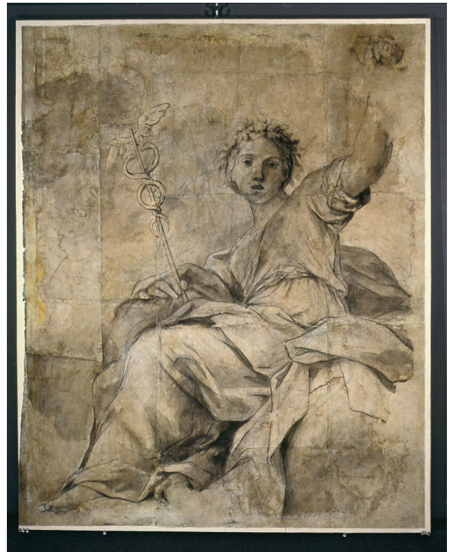
Fig. 8. Seventeenth-century Italian preparatory cartoon after treatment and mounting on a Japanese screen style panel