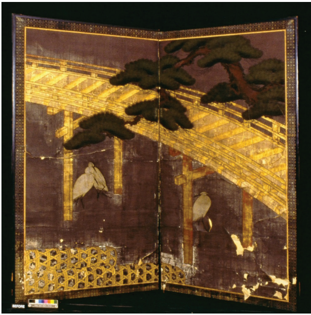
Fig. 3. Japanese screen before local treatment

be a source of staining, because of slower drying, or a source of planar distortion because they constrain expansion. Is it safer to spare a work the manipulation that separation involves, or to facilitate handling smaller sections of a piece? Does it facilitate the gradual building up of reinforcement that allows for corrections in tear registration, filling, intermediate and final flattening, and the control of expansion and moisture penetration during lining and remounting?