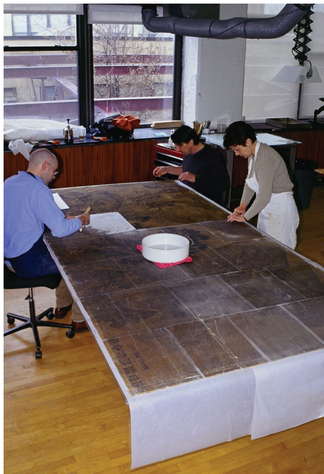
Fig. 1. Seventeenth-century Chinese painting from Taliesin being prepared with a facing of rayon paper

What made this treatment a hybrid? It is a Chinese painting, on continuous display, in an icon of American architecture. The panel structure is derived from Western painting conservation while the treatment and surface preparation used Japanese materials and procedures. Because the large stain at the bottom was in the paper below the silk as much as the silk itself, local bleaching and