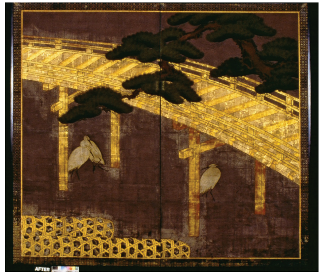
Fig. 4. Japanese screen after local treatment

The Japanese panel overcomes the limitations of working with standard-size materials because the lattice core can be made in almost any dimension as either a panel, with both sides covered, or as a fixed wall surface, with one side covered. The multiple layers all have very specific functions, including insulation from a wooden framework whose shifting could otherwise transmit tears, building up the rigidity of the panel, capturing air that will mitigate changes in relative humidity, and, finally, making