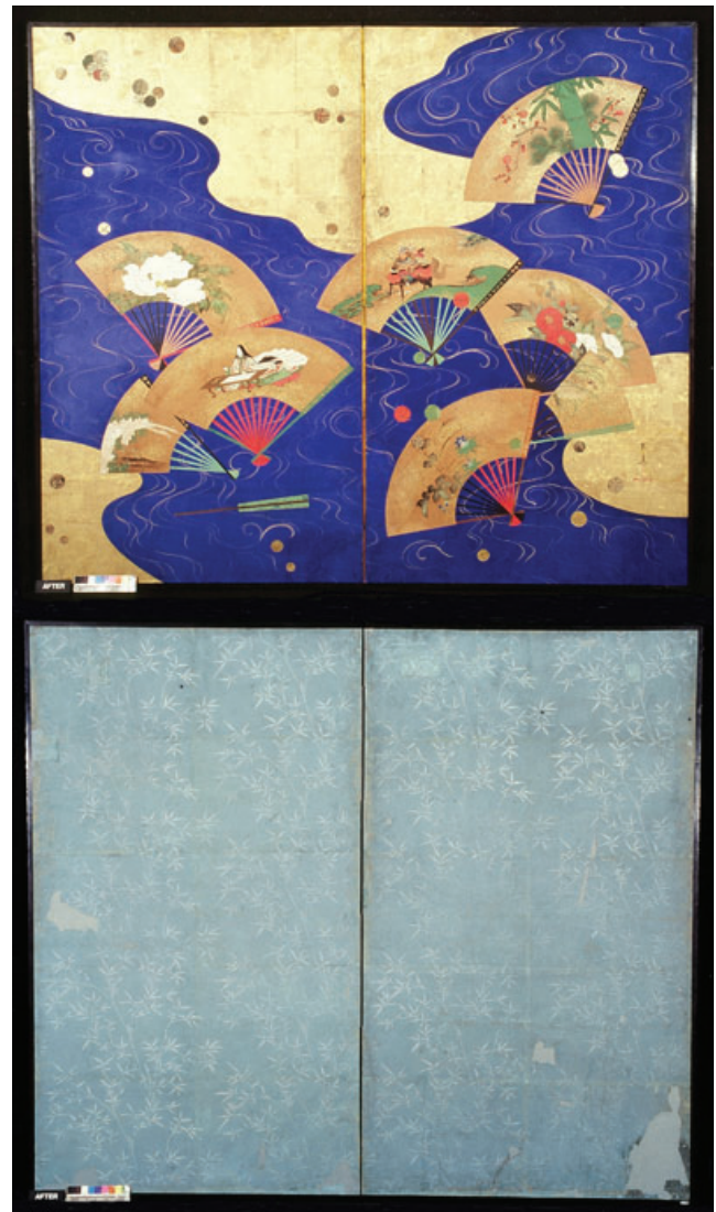
Fig. 6. Japanese screen after overall treatment of painting and back papers

Procedures used on scrolls for reinforcing tears with cut strips after lining, for minimizing the overlapping edges of a fill on thin paper, for burnishing the linings, and for assembling sections and flattening under tension have been enormously useful as well, particularly on very lightweight or translucent Western works such as drawings on tracing paper.