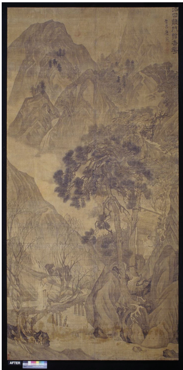
Fig. 2. Seventeenth-century Chinese painting after treatment and mounting on an aluminum honeycomb panel

rinsing were possible after the first lining was applied, although with only limited success. Similar stain reduction techniques have been used on Western works on fabric as well as Asian works on paper. Because bleaching agents are not widely used in either Japan or China, I welcomed comments from several textile conservators and scientists, specifically about the safety of exposing protein fibers to bleaching agents. Because I sensed that it was viewed with no more wariness than bleaching cellulose fibers, I felt that it was a legitimate difference with traditional practice. The inpainting was confined to tear edges and abrasions on the