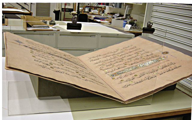
Fig. 13. Repaired manuscript ready for cradle measurement

Contact as of October 2008: Senior Book Conservator The Leather Conservation Centre Northampton, UK karen_vidler@hotmail.com