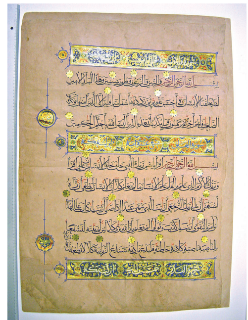
Fig. 1. Folio 18r showing surah headings and margin instructions

A pink-pigmented surface size had been applied with uneven brush strokes to all leaves except f1 and f2, which have the characteristic biscuit-brown color of Islamic papers. 2 In Syria and Egypt red was considered the color of festivity and joy, and the light red and rose-tinted papers were popular for this reason. Vegetable starch size was usually used to produce a suitable non-absorbent surface, with