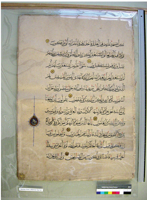
Fig. 4. Leaves in large Melinex sleeve