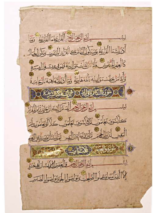
Fig. 3. Typical paper damage can be seen on f19

Folios f9, f10, and ff17–19 had extensive losses to the gutter area, which may be attributed in part to the mechanical removal of the conjoined bifolium (fig. 3). The damage and extensive areas of loss were probably a result of the gatherings not being supported by a binding; sagging of the oversized leaves during handling would have promoted tears from the gutter towards the center of the leaves and caused them to pull away from existing sewing with consequent areas of loss.