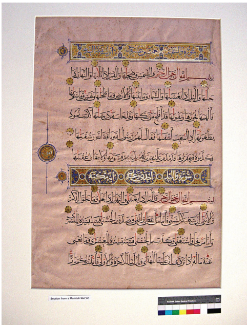
Fig. 5. Folio 17 mounted for display purposes

The leaves had previously been collated in a numerical order despite the broken sequence of surahs as denoted by the dotted line between some of the gatherings in figure 6. A conjoined bifolium missing from folios f9, f10, f17, f18, and f19 is denoted by a hooked, broken line.