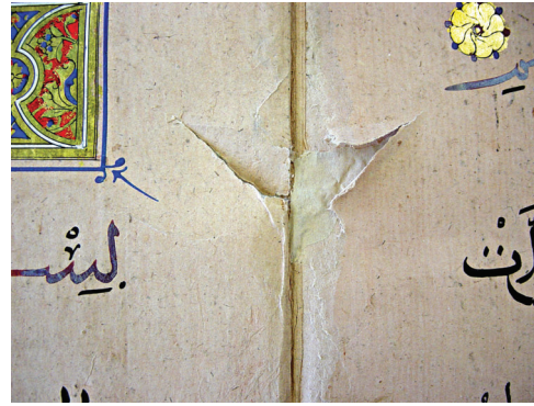
Fig. 10. Toned repair paper pasted into position

weight repair paper than could be used on the exterior of the damaged area.