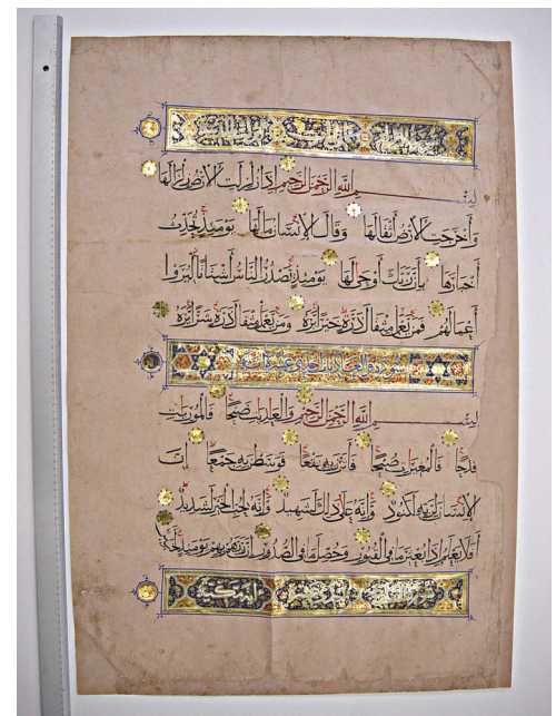
Fig. 11. Folio 19 after repair

Discussion with the curator brought up various points. Initially he felt very strongly that if the binding were not original or a facsimile of the style of binding that the Qur'an would have had originally, then it would be mis-