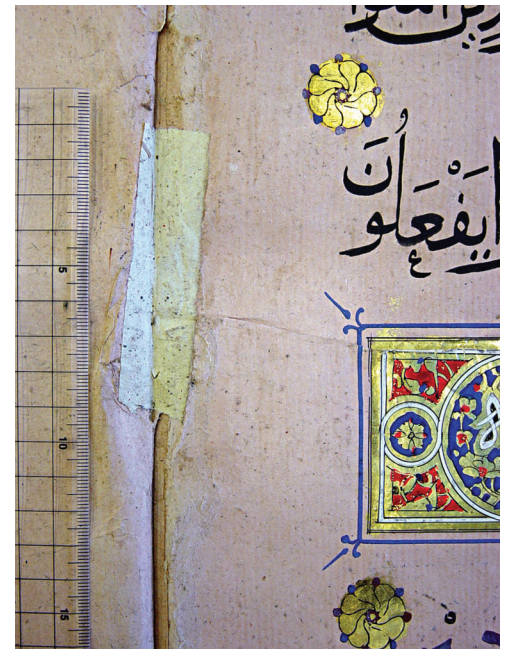
Fig. 7. Previous gutter repair using paper strips

It was agreed that the most effective way to repair the tears emanating from the gutters of the bifolia into the text area would be to split the paper and insert a toned Japanese paper using wheat starch paste (figs. 9–10). This was to minimize the repairs obscuring the decorative surah areas or calligraphy, and to give greater strength by using a heavier