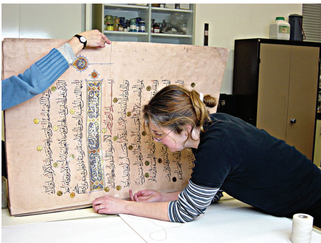
Fig. 12. Consolidating the gatherings with link-stitch sewing

The decision was made to use a link stitch, but not the traditional link-stitch configuration used on Islamic codices. Ordinarily only two sewing stations are used, ignoring the format (size) and weight of the book, which may require support from the sewing at more than two points. Consequently a total of seven stations were used, five link stitches and two kettle stitches, which resulted in even support along the extensive length of the gutters of each gathering (fig. 12). Due to the preference for using a