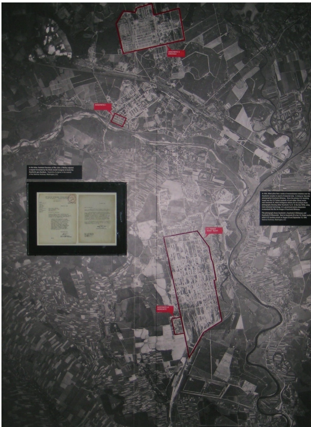
Fig. 1. United States Holocaust Memorial Museum, Why Auschwitz Wasn't Bombed , Permanent Exhibit, section 3.40.

sitive materials and media and would deteriorate if placed on view long-term. On the third floor of the Permanent Exhibit is a photomural of a U.S. Air Force Intelligence photograph of Auschwitz-Birkenau taken on May 31, 1944 (fig. 1). Clearly visible are the trains on the tracks, smokestacks, and barracks. Superimposed on the photomural is a case displaying a letter from the World Jewish Congress to the Assistant Secretary of War John J. McCloy requesting the U. S. Air Force bomb the concentration camp in order to halt or significantly slow its operations. To the right is the response—a clear and succinct refusal (fig. 2).