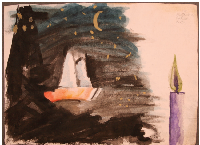
Fig. 4. Ellen Kahn, facsimile of Boat and Candle , 1991. 21 x 29 cm, USHMM.

Once the use of artist-made facsimiles using historically accurate materials was accepted, it was not difficult for the curators to accept the use of a reproduction made with modern materials. There is a large poster on display in the Nuremberg Laws section of the Permanent Exhibit which illustrates the edict against interracial relationships and the consequent defilement or shaming of the Aryan race— Rassenschande (fig. 5). Visually the poster is extremely compelling, presenting societal stereotypes to illustrate the dangers. In spite of its susceptibility to light damage, it was