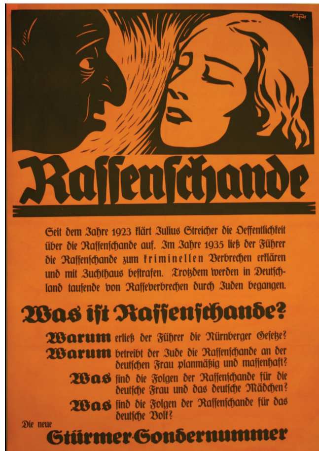
Fig. 5. Rassenschande , ca. 1935, 119 x 82.6 cm, USHMM 1990.41.13.

on exhibit for more than seven years, because the curators felt it to be essential in illustrating the effectiveness of the Nazi propaganda machine, especially in negatively depicting the Jewish populace. Resources had been committed to obtaining another copy, but no other example of this poster