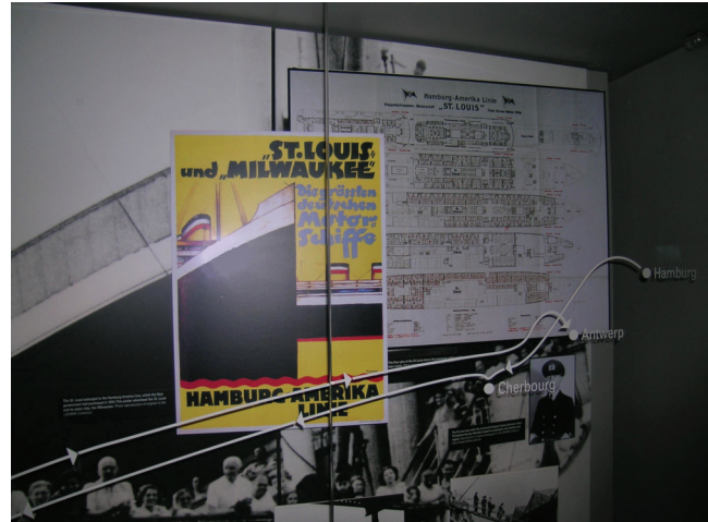
Fig. 8. United States Holocaust Memorial Museum, St. Louis Case, Permanent Exhibit segment 4.28.

question then becomes whether evidentiary value can be transmitted through facsimiles and reproductions and, if not, how to preserve and protect the original against damage through overuse. By considering all of these aspects and exploring the different methodologies for their production, the use of surrogates for exhibition has become more precise and customized to the requirements of the curators and an accepted preservation tool.