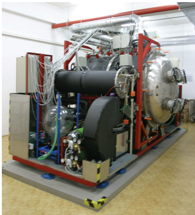
Fig. 2. The multifunctional vacuum chamber (view from the opposite side)

Good drying results depend on the accuracy of the drying parameters—above all on pressure, temperature, and relative humidity. We decided therefore to construct an additional, independent measuring system based on the usage of special sensors in a control (“signal”) book and in several other places inside the chamber, as well as a tensiometer for recognizing weight (water) loss. Data obtained from this system are accessible on the control PC and by internet transmission to dedicated remote PCs of key personnel. We monitor the humidity of the books after drying manu-