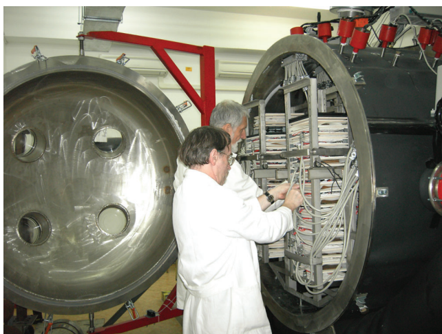
Fig. 3. Connecting cables to the heating tiles