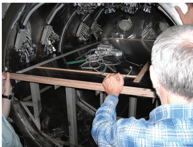
Fig. 6. Preparing the chamber for the drying of large-format documents

In the next phase, we would like to further exploit the chamber's properties. The combination of nitrogen, a vac-