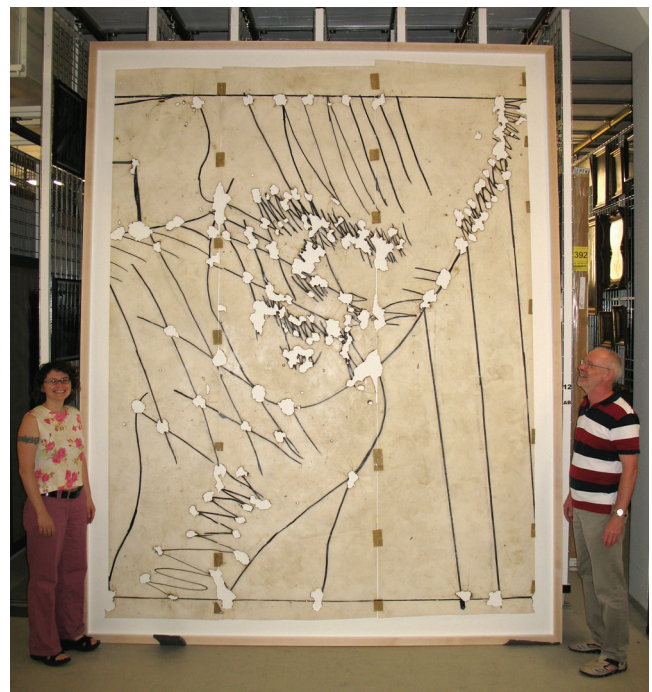
Fig. 9. Frank Dornseif's Self Portrait in Nepal , 1987, after treatment and mounting. Black marker, yellow oil stick, studio dirt, and packing tape on tracing paper with burnt holes, 3.23 x 2.48 m. Collection Kupferstichkabinett-Berlin (LB 68-1992).