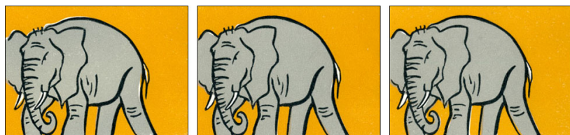
Fig. 2. The three prints examined from the series Elephant (Elies Plana).