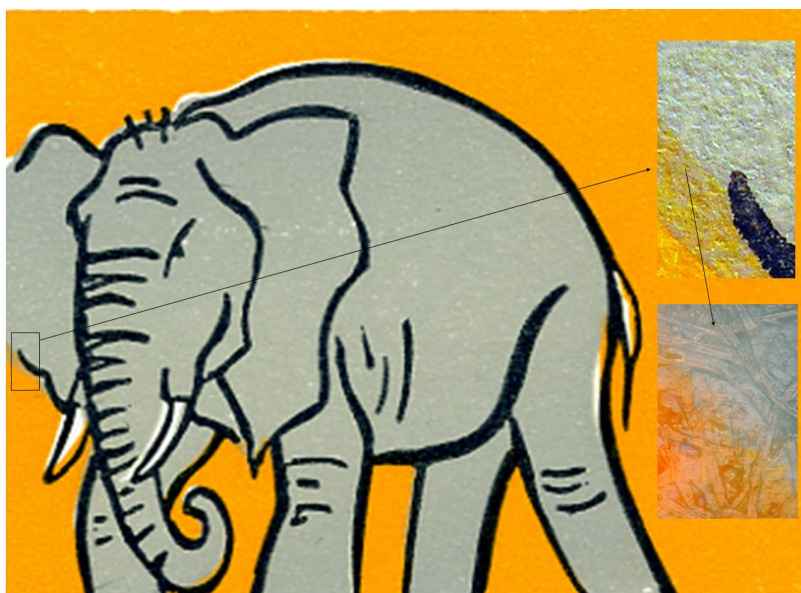
Fig. 3. Detail (20-60x) from the area of overlapped inks in a print from the Elephant series.

Overlapped gray-yellow area: The three prints have the same behavior in the overlapped gray-yellow areas (fig. 3). Results obtained from the monolayer ink show that the intensity of the Raman signal from the gray ink is smaller than the one from the yellow ink. On comparison of the intensities obtained in the gray-yellow overlapped areas of the reference signals (once it has been standardized and normalized), only eight of sixty measurements indicate that yellow ink is on the surface. The other fifty-two measurements indicate that gray ink is on top. The explanation of these eight measurements can be related to the heterogeneous distribution of inks on the soft paper surface. By using a paired test to compare the complete set of the dif-