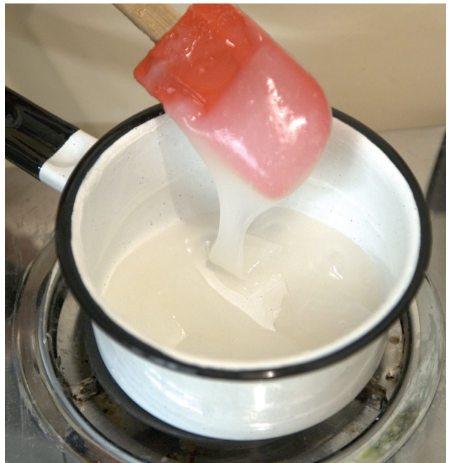
Fig. 6. Bubbles develop and elongate. Paste takes on a slightly gelatinous or rubbery quality and becomes more opaque.