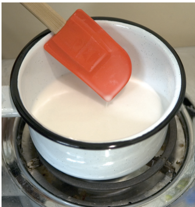
Fig. 2. Starch-water mixture is opaque white with a thin, milky consistency.