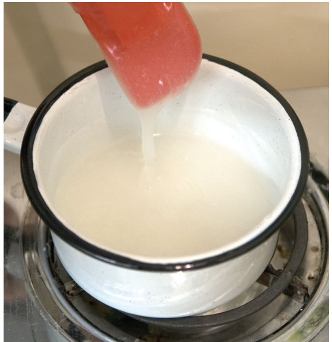
Fig. 5. Air bubbles develop as paste thickens further.