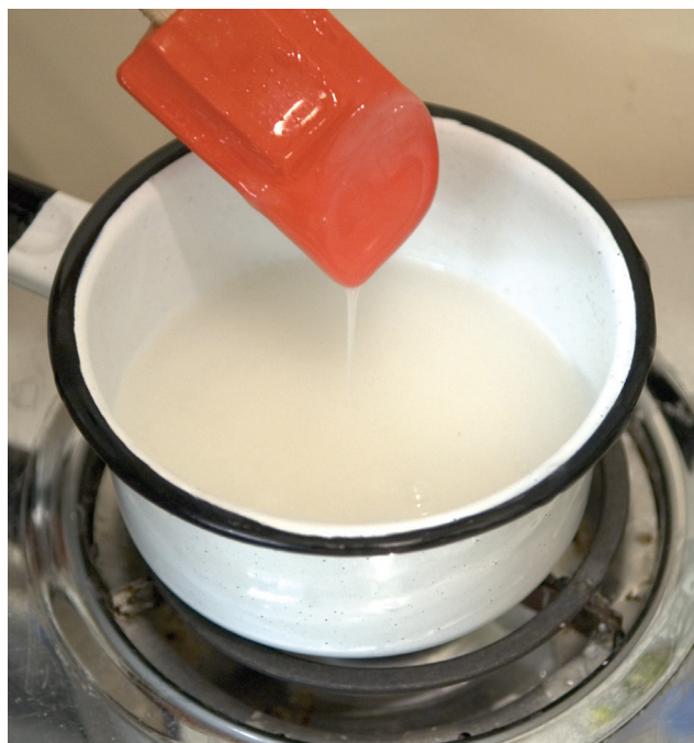
Fig. 3. Mixture becomes translucent and thickens slightly.

Sheer strength of the test hinges was evaluated by lightly tugging at the bottom of the hinged sheet. Batches 1, 2, and 3 all produced strong hinges that held with no visible distortions in the hinged sheet. The consistency of batch 4