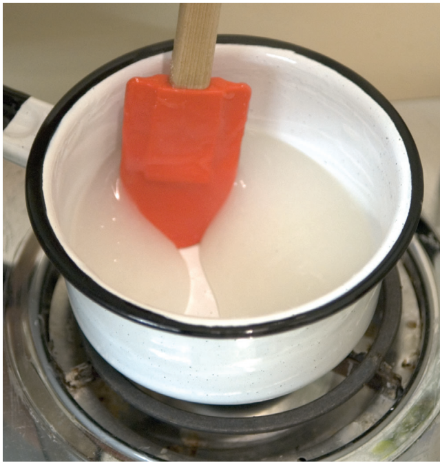
Fig. 4. Paste continues to thicken and becomes “syrupy.”