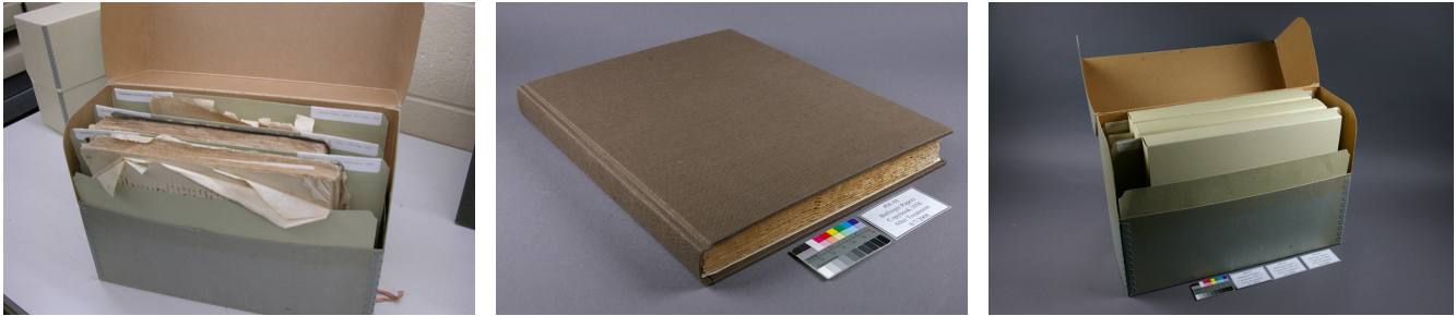
Fig. 3–5. Ballinger Letterpress Copying Book. Existing housing condition (left); after treatment, new case (center); and after treatment, new custom enclosures (right). Ballinger Papers 1856, The Center for American History, University of Texas at Austin

storage of the textblock in a document case without the support of a binding, but the paper remained relatively flexible (fig. 1). The Fulton copying book dated 1890–91 exhibited severe embrittlement, darkening, foxing and reverse foxing, but the binding was in relatively good condition (fig. 2). Both books exhibited widespread fading, offsetting, and feathering inks. One section from each book was removed in order to treat the individual leaves. Surface cleaning was performed as needed with a Hake brush, soot sponges, and a microspatula. Local humidification was performed with a small sable brush, cotton swabs and de-ionized water to release tight creases and folds, as needed to allow legibility. Selected leaves were humidified overall in a humidity chamber and flattened between wool felts. A few leaves were washed in successive five-minute baths of re-calcified de-ionized water. Lining repairs were performed using lens tissue applied wet with 4:1 wheat starch paste, as well as with a variety of prepared tissues using the following adhesives: 2% Klucel G, Lascaux 498 HV, and 2:1 wheat starch paste / methyl cellulose. The Klucel G and Lascaux tissues were re-activated using ethanol, isopropanol, acetone, and heat. The re-moistenable tissue was re-activated with humidity. Several methods of application were performed for each type of lining. After treatment the bindings were stabilized, housed in custom tuxedo boxes, and returned to their existing manuscript boxes (figs. 3–5).