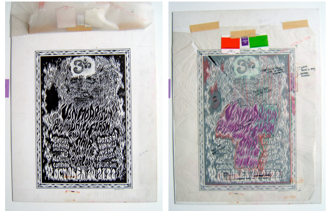
Fig. 8. Key-line mechanical. Black ink on illustration board (left), color pencil on tracing paper overlay (right). Wes Wilson, FD-88, poster for Van Morrison, Daily Flash, and Hair, 1967

printing had a way of clearly indicating or separating the design elements according to each color that was to be printed. The three methods primarily used to make the rock posters were acetate overlays, key-line mechanicals, and bluelines.