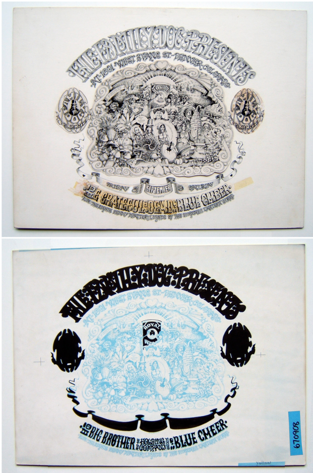
Fig. 9. Black ink drawing on illustration board (top), blueline print and black ink on illustration board (bottom). Rick Griffin, FD-79, poster for Big Brother & the Holding Company, Blue Cheer, and Eighth Penny Matter, 1967

photographed to make a negative. The resulting negative was then contact-printed on illustration boards or papers sensitized with diazo salt compounds to produce several blueline images. Then, working from these identical blueline images, the artist used black ink to demarcate the design elements corresponding to different colors (fig. 9). The beauty of the blueline is that when the paste-up is photographed, the blue is not recorded by the orthochromatic graphic arts film. Thus, the negatives produced showed only the design elements inked by the artist.