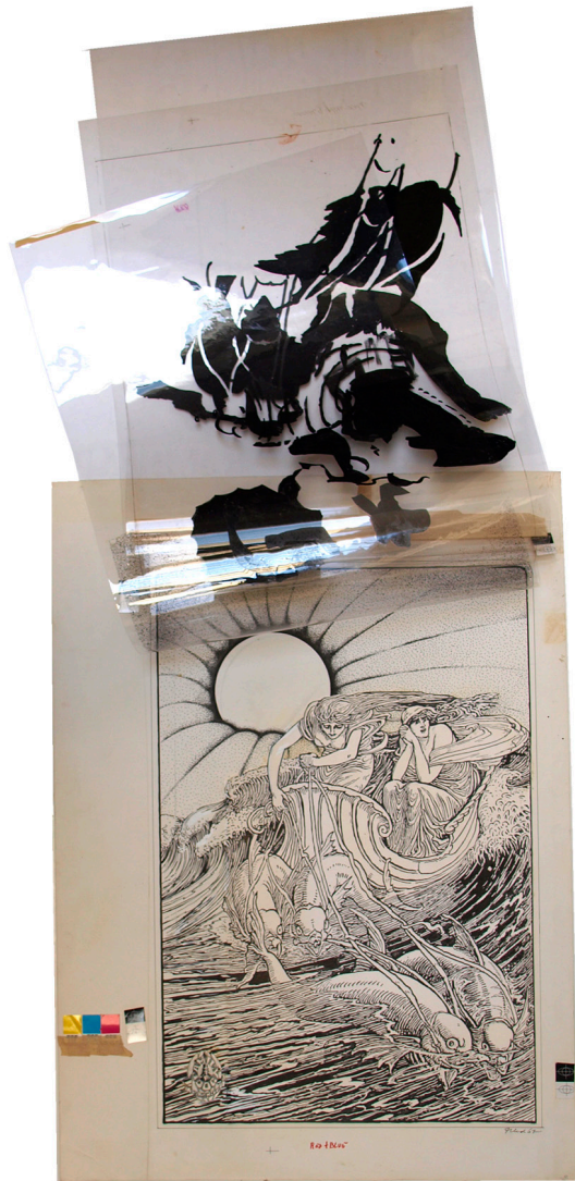
Fig. 6. Paste-up with black ink on illustration board and acetate overlays. Robert Fried, FD-D14, poster for Canned Heat and Siegal Schwall, 1967