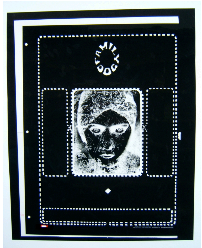
Fig. 10. Negative. Stanley Mouse and Alton Kelley, FD-30, poster for Big Brother & the Holding Company, and the Sir Douglas Quintet, 1966

The finished mechanical and all its overlays were photographed individually on a copy stand. The mechanical was held in place at one end by a copyboard, and the film was inserted at the other end in a film holder. The film used to shoot the artwork was made especially for graphic arts production work. As the film was high-contrast, all