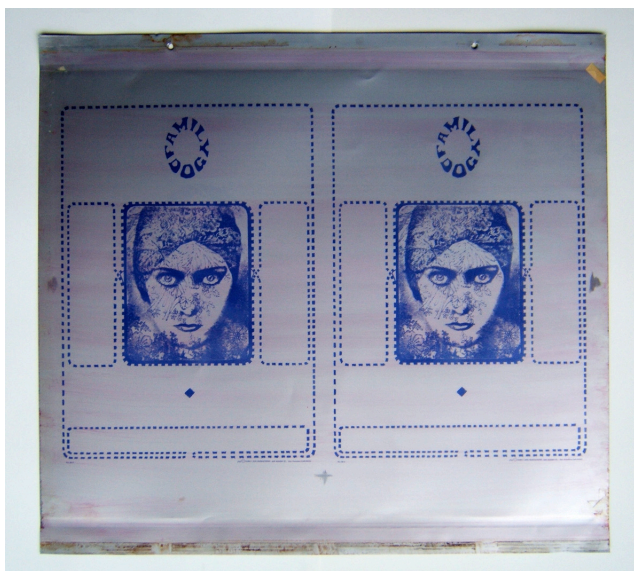
Fig. 12. Printing plate. Stanley Mouse and Alton Kelley, FD-30, poster for Big Brother & the Holding Company, and Sir Douglas Quintet, 1966

was placed in direct contact to the sensitized surface (emulsion to emulsion) and secured in a vacuum frame. The plate and the negatives were then exposed to a light source with strong ultraviolet output. The exposed image areas of the light sensitive surface were hardened and the unexposed material was removed during development. After rinsing, the plates were ready for printing.