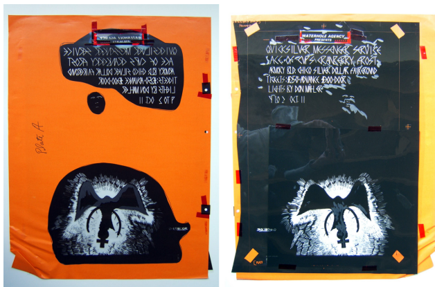
Fig. 11. Flat. Front showing windows cut out of opaque masking paper revealing negatives (left), back of flat showing cut pieces of negatives taped together (right). Jack Hatfield, poster for Quicksilver Messenger Service, Ace of Cups, and Cranberry Frost, 1967