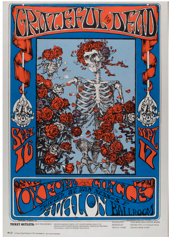
Fig. 1. Stanley Mouse and Alton Kelley, FD-26, poster for the Grateful Dead and Oxford Circle, 1966. 50.8 x 35.5 cm. Fine Arts Museums of San Francisco, Achenbach Foundation for Graphic Arts, 1974.13.100. Image of skeleton and roses taken from Rubāiyāt of Omar Khayyām with illustrations by Edmund J. Sullivan

featured some of the most iconic bands of the time including Jefferson Airplane, The Grateful Dead, The Doors, and Big Brother and the Holding Company. These dance concerts were absolute visual and auditory experiences, with elaborate light shows and colorful bubbling overhead projections.