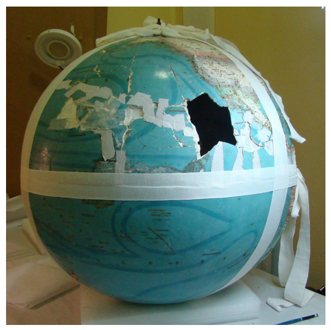
Fig. 9. Re-attachment of the two halves of the sphere

conservation-quality materials. For the broken pieces and consolidation of the original plaster, a neutral-pH ethylenevinyl-acetate (EVA) adhesive was used (fig. 7), which was chosen for its strength and reversibility with water.