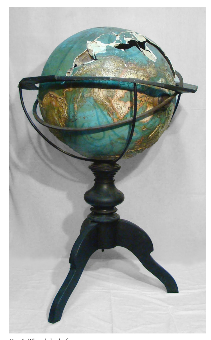
Fig. 1. The globe before treatment

The globe and stand had also been subjected to use and wear over the past 160 years. Prior to treatment, the globe had a layer of yellowed, brittle varnish that compromised the general view of the object. There was also an accumulation of surface dirt that made the labels difficult to read. Abrasion and the use of inappropriate cleaning products had caused additional loss of the varnish layer, weakening of the paint layer, and loss of certain labels and the information they contained. Overpaint was also noted in some areas, especially in the Argentinean region (fig. 4).