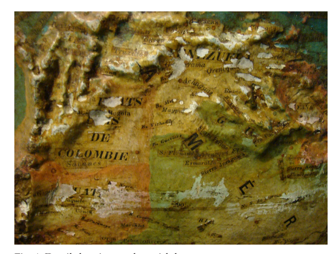
Fig. 4. Detail showing aged varnish layer

The treatment focused mainly on correcting the damaged support and bent metal components to allow the globe to rotate as before. Cleaning the globe's surface and correcting