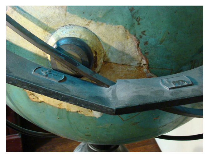
Fig. 3. Detail showing the damage suffered by the metal horizon ring