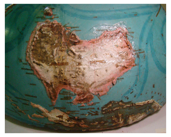
Fig. 8. During the cleaning process