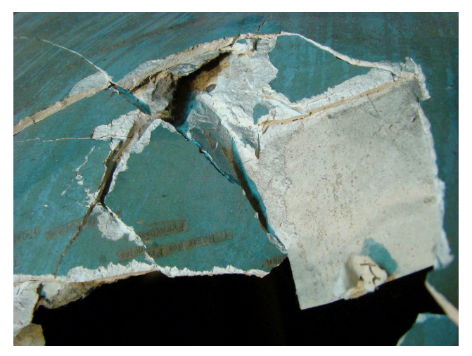
Fig. 2. Detail showing breakage and structural loss