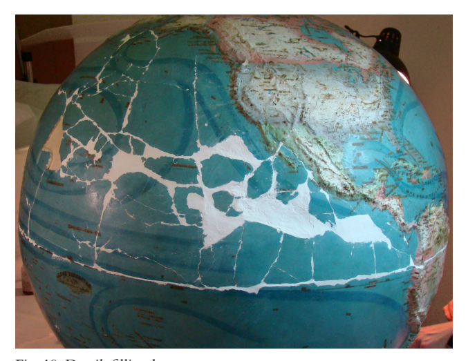
Fig. 10. Detail, filling losses

A final layer of ketone resin dissolved in white spirit was used to varnish and protect the retouched areas of the globe. Regrettably, two years after the treatment, there has been a slight darkening of these areas. This is attributed to the quality of the varnish and the ketone resin, which is softer than