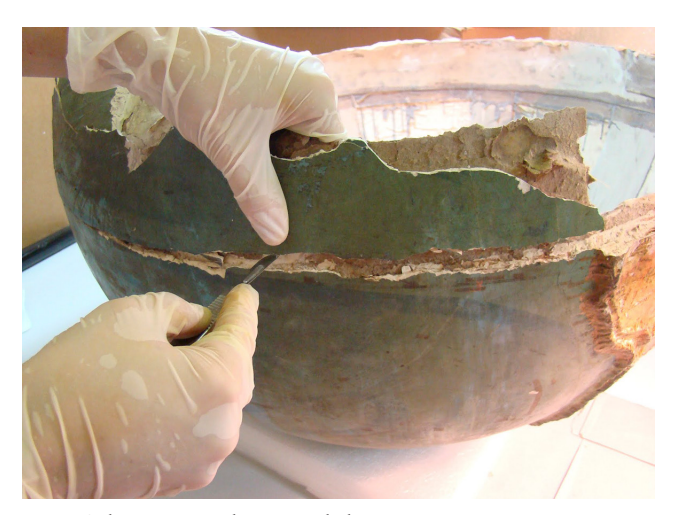
Fig. 5. Sphere separated into two halves