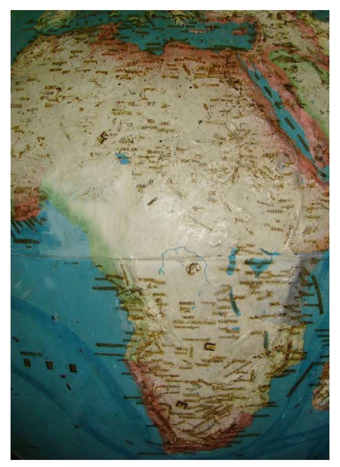
Fig. 11. Detail, retouching

acrylic resin. An acrylic resin was not chosen at the time of treatment because any solvent used to remove this type of varnish would also endanger the paint layer and the printing ink from the original labels. There is currently a project to eliminate the ketone resin from the whole surface of the globe and to apply acrylic resin (Paraloid B72 dissolved in butyl acetate) only in the retouched areas, avoiding damage to the original oil paint and the labels' ink in case of removal.