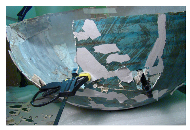
Fig. 7. Consolidation of broken pieces