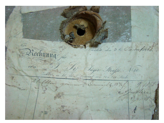
Fig. 6. Paper used as part of the papier-mâchè structure printed with the date 1845

its deformations were also of primary importance to allow the globe to function and increase the appreciation of its original aesthetic. The treatment was completed in a period of six months.