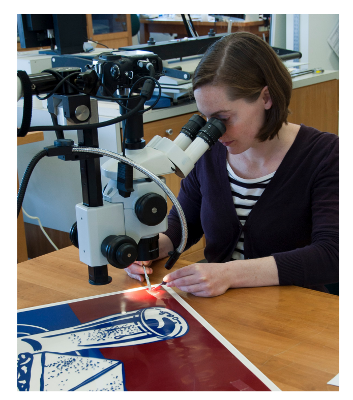
Fig. 3. Sampling the tape carrier under the microscope

Micro-samples of each ink (blue in the edge of the printed area and red in the overlapping area) were taken under a microscope, as was a sample of the clear plastic support, shaved from the very edge of the object. A sample of each type of tape was also taken at the lifting edges (fig. 3).