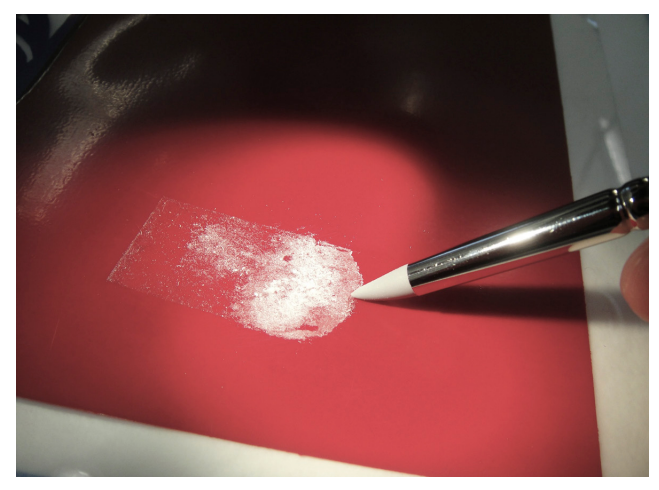
Fig. 4. Removal of tape adhesive residues with cellulose powder and a Colour Shaper tool

office tape on the other copy with great success. In both cases, the Colour Shaper tool was better than any white vinyl eraser pencils for reducing the adhesive residues. The results were very satisfying (fig. 4).