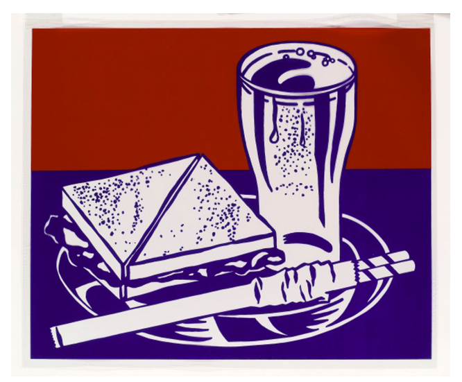
Fig. 1. Roy Lichtenstein, Sandwich and Soda, 1964, blue and red ink screen print on clear plastic, 48.3 \times 58.4 \text{ cm}

Presented at the Book and Paper Group Session, AIC's 41st Annual Meeting, May 29–June 1, 2013, Indianapolis, Indiana.