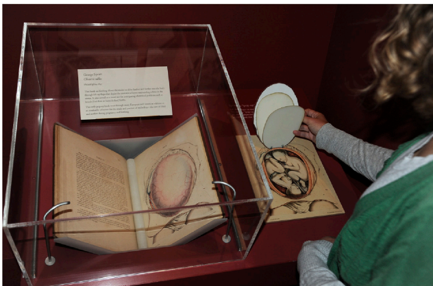
Fig. 2. A visitor interacts with a surrogate of an anatomical model from George Spratt's 1841 Obstetric Tables , Huntington Library.

There are times when library items are too delicate to be handled as desired, but book conservators strive to prepare