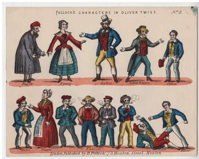
Fig. 3. The original, uncut version of Pollock's illustrations for Charles Dickens's Oliver Twist , meant to be cut out and used for puppet theatre.