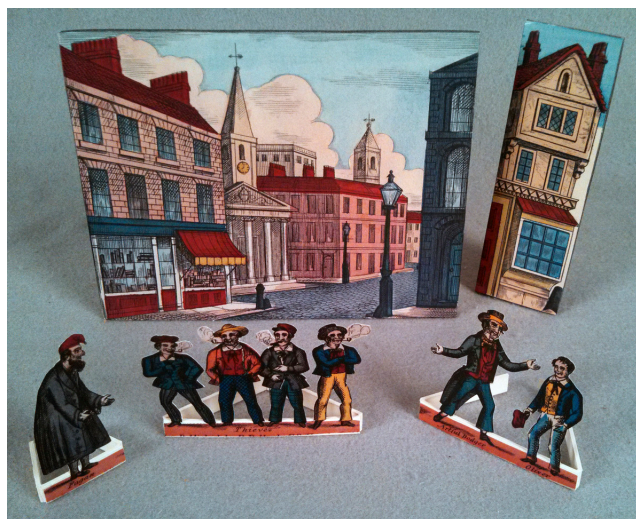
Fig. 4. Although the original illustrations were visually appealing, they were made with light-sensitive watercolors. This cut-out 3D puppet version offered something extra that helped convince the curator to use the facsimile instead of the original.