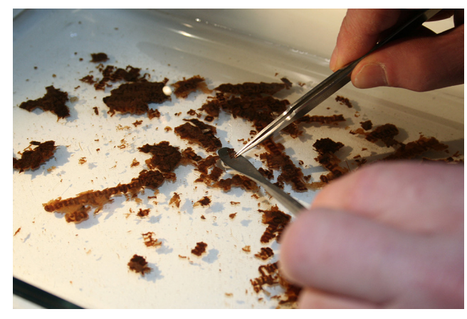
Fig. 11. Smaller fragments of vellum under conservation treatment.

The end product is stable and reasonably robust but with no fold endurance. Although in appearance the stabilised fragments with their muddy brown colour and ragged edges might tempt you to believe that it is no longer vellum. I was reminded on one occasion that this is not the case<sup>18</sup>.