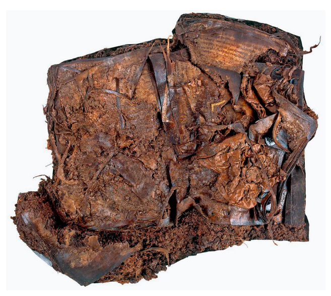
Fig. 1. The Faddan More Psalter after its retrieval from the bog.