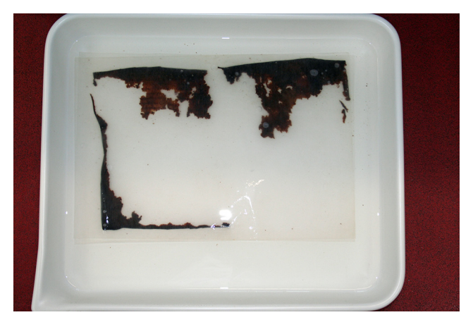
Fig. 9. Solvent exchange bath containing with f47v-56r to view.