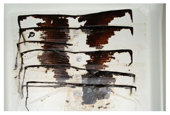
Fig. 3. Bifolia of quire two separated and ready for cleaning.

The first task prior to removal was to study the small area of extant backfolds. As these were in-situ they gave some clue to the original make-up of any given quire, also some codicological detail could be extracted such as the use of singletons or inserted folios. This proved to be a difficult and time consuming task but essential if we were to successfully establish a collation map of the manuscript. It should be remembered that even though we had a well-known and recorded text in the Psalms, we had several folio fragments where no writing had survived and only its position in the quire gave any clue to its identification. The physical position of the text block very much dictated the order of dismantling, and it was approached layer by layer, searching for natural divisions between the clumps of material, this usually occurring between quires. A thin slip of printers plate, cut to approximate the width of the piece in question was covered with a fold of silicone Mylar® and slowly eased between, the spraying with deionized water of the separation point assisted the transmission and reduced surface friction. This process continued until the delineation between the layers was no longer in evidence, and at this point the material, which was at a more advanced stage of deterioration, had become a single mass of gelatinised vellum, surviving letters and bog material, containing plant roots, seed pods and degraded plant material.