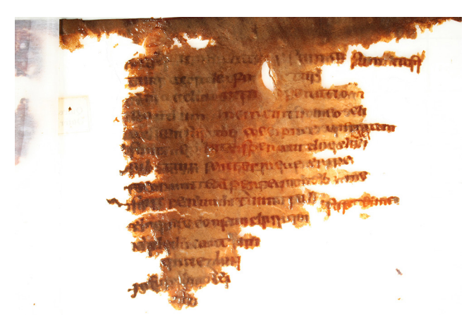
Fig. 4. Folio 13r after cleaning still saturated.

direct contact. When nearing the end of a wet stage cleaning, denatured alcohol would be introduced in solution in order to introduce the vellum to the solvent that would later be employed in the de-watering process