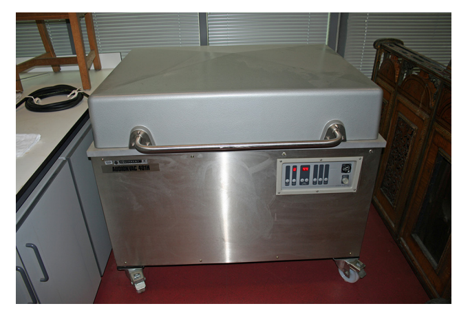
Fig. 10. Audionvac 401H vacuum m/c.