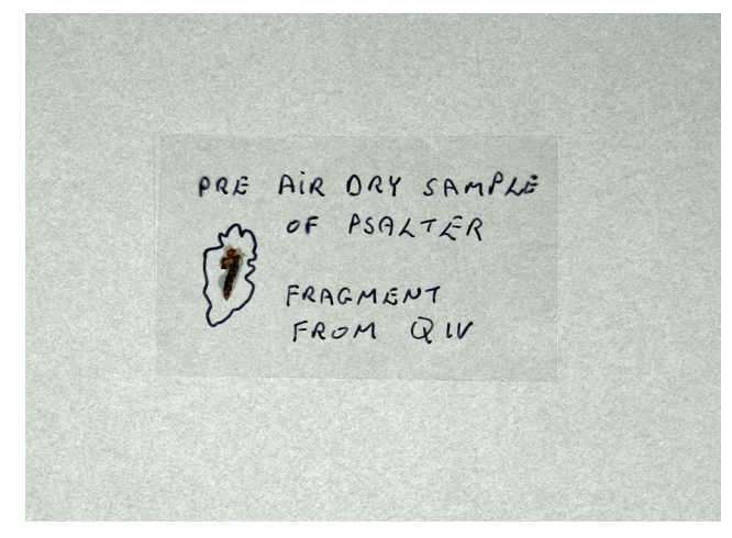
Fig. 5. Air dried fragment showing level of shrinkage.

One of the difficulties of trying to discover how best to dry out the vellum was the lack of material on which to test any possible solutions. The unique nature of the problem also meant there was little to nothing in the way of previous published material on the subject. In order to address the first issue some discarded vellum flyleaves from a late 18th century binding were prepared by hydrating between saturated