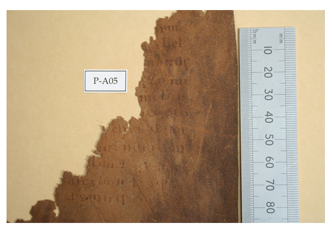
Fig. 8. First successfully de-watered fragment of the Psalter vellum.