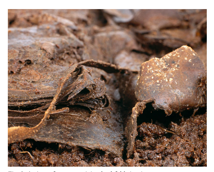
Fig. 2. A view of some surviving backfolds in-situ.

bog. Also, typically organic material survives better here than in soil, research suggesting that sphagnum moss, a component part of a peat bog plays a major role in this process. It has the ability to immobilise microorganisms and according to Terence Painter<sup>11</sup>, produces an antibiotic substance called sphagnan that bind with proteins on the surface<sup>12</sup>. The concern was that by maintaining the saturated levels by spraying with de-ionized water the effectiveness of the bog water was diluted each time. Fortunately we saw no such growth during any stage of the work (fig. 2).