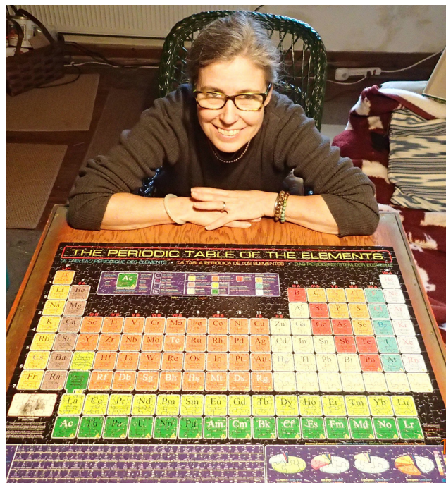
Fig. 4. The author after having completed the Periodic Table puzzle.

The jigsaw puzzle that was started over the holidays was completed by filling in the Lanthanides. It is hoped that this introduction will entice all conservators to put another tool—rare earth magnets—in their tool box. Perhaps this will encourage conservators to develop systems to reuse magnets better, and to create reusable standardized systems for mounts. The field of art conservation will benefit greatly from using rare earth magnets. As we do so, let us in this, and in other aspects of our work, be aware of “best environmental practices” just as we do our best to follow best practices in our treatments. (fig. 4)