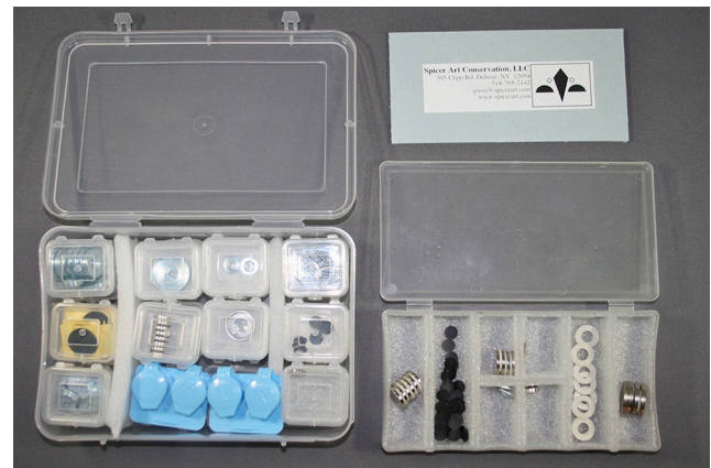
Fig. 1. Solutions for storage of rare earth magnets, showing a range of box sizes and styles. Ethafoam sheet lining placed in the boxes provides cushioning of the magnets.

One of the survey questions focused specifically on how conservators stored their magnets. As a response, here are a few rules of thumb: